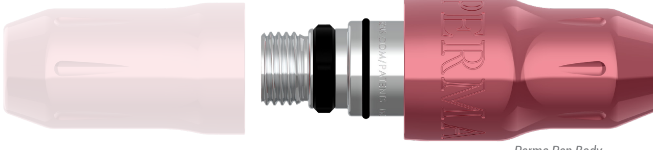
Perma Pen Body