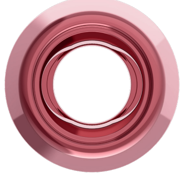
Autoclavable Ergonomic Grip design