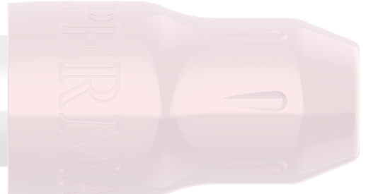
Perma Pen Grip