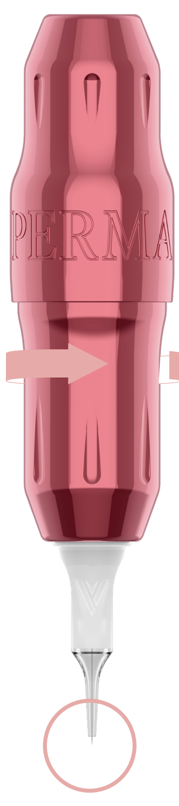
Decreases needle depth

Turning the Grip as the arrow direction show increases needle depth