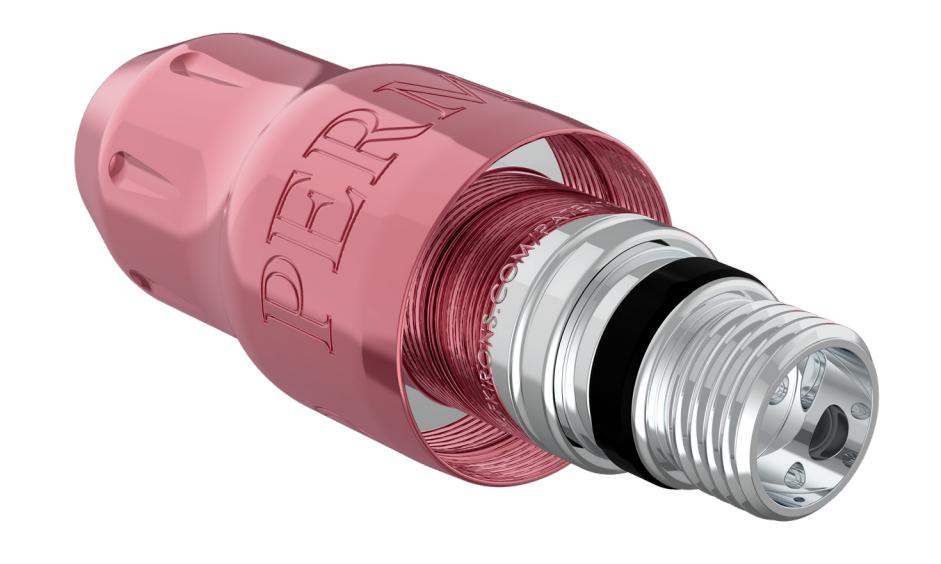
Body posterior view

The Body is the core of the machine that houses all its components. Constructed from a solid rod of 6061 T6 aircraftgrade aluminum, this module should be sanitized by wiping it with cold sterilization solutions only. Caution: Do not introduce any types of liquid inside the system or autoclave.